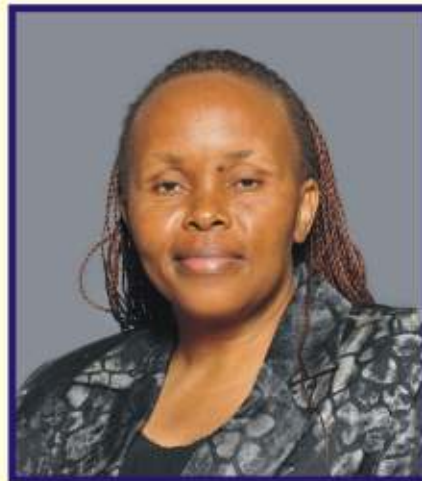
Executive Mayor Cllr. EN Makhabane